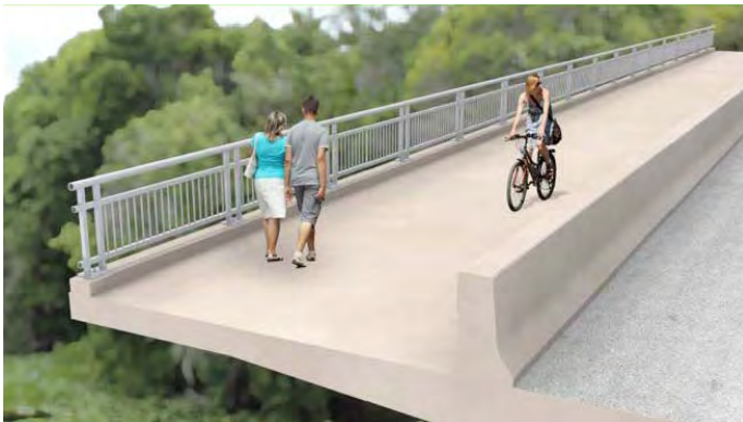
Preferred Option B – Fully Open Pedestrian Rail

The fully open pedestrian rail was identified as the preferred option as shown by the results above.