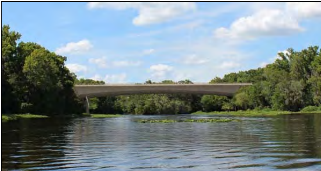
Final Rendering of Bridge Elevation View Looking North