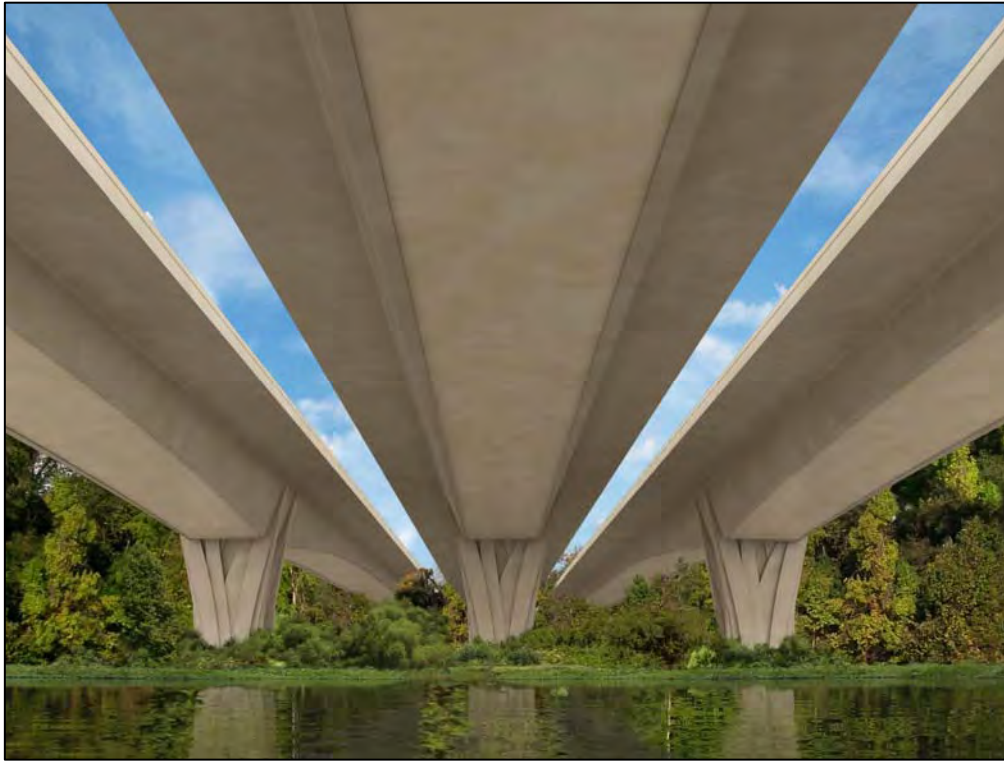
Final Rendering Underneath Bridge Looking West with Light Tan Underside