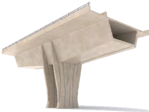
Pier Concept A

Pier Concept B consisted of multiple layers appearing like trees fanning out transversally. While this concept did not include surface texturing, the multiple layers of the pier created texturing using the depth of the different layers. This pier was more slender at the top of the pier.