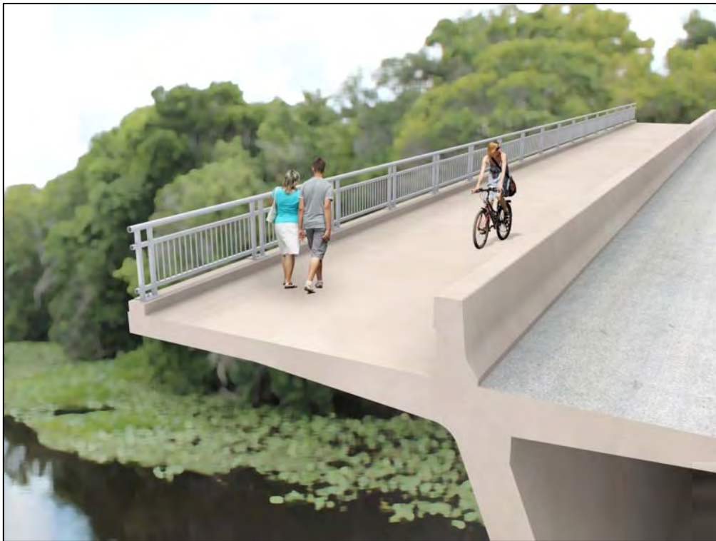
Final Rendering of Multi-Use Trail Pedestrian Railing on Service Road Bridge