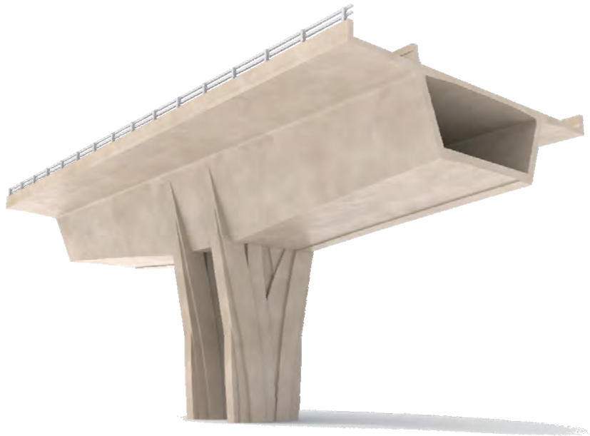
Preferred Pier Concept B – Isometric View

Because the results of Round 1 voting showed a preference for concepts B and D, a second round of votes were taken for Pier Concepts B and D only. Of the 15 participants who voted in Round 2, eight (8) preferred Pier Concept B while seven (7) preferred Pier Concept D. Therefore, Pier Concept B was identified as the preferred pier shape. After Pier Concept B was identified as the preferred pier concept, the group was asked if there was anyone who was opposed to Pier Concept B being used for the bridge. There were no comments or opposition from the participants to Pier Concept B.