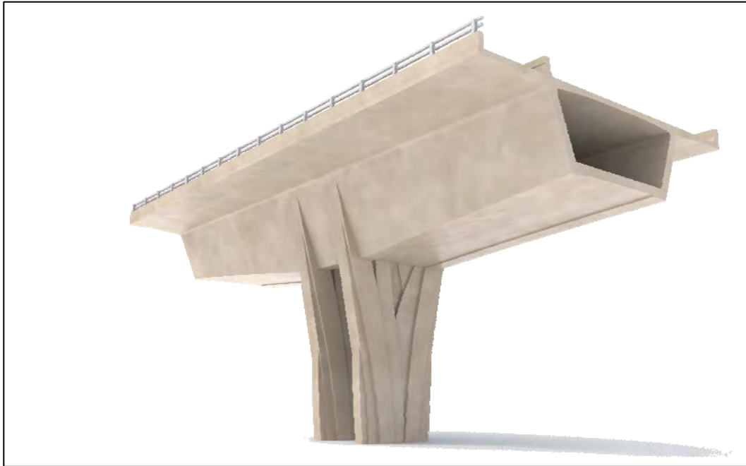
Final Rendering of Preferred Pier Concept B