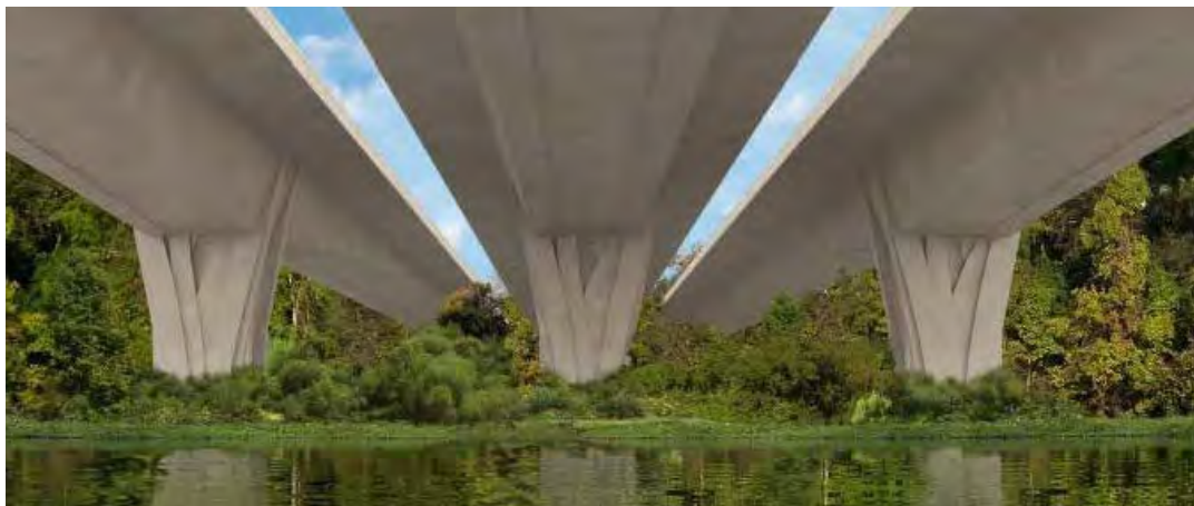
Preferred Pier Concept B – Underneath View