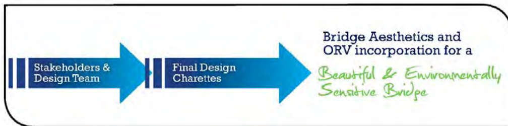
Schematic of Bridge Design Charette

Following the Bridge Design Workshop, two FIGG Bridge Design Charettes were held with the NPS and Wekiva stakeholders. Each Charette provided a full day of discussion and voting on aesthetic concepts for the proposed Wekiva River Bridges. The process of discussing and determining these aesthetic concept options is called a Design Charette which is like a workshop where consensus preferences are determined by the participating stakeholders.