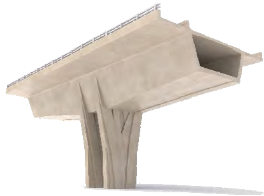
Pier Concept B