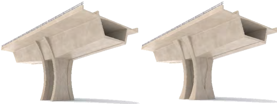
Pier Concept C

Pier Concept D consisted of abstract shapes inspired by the occasional cypress tree that is seen along the Wekiva River. This pier shape is made up of organic lines to mimic the natural lines that occur in nature.